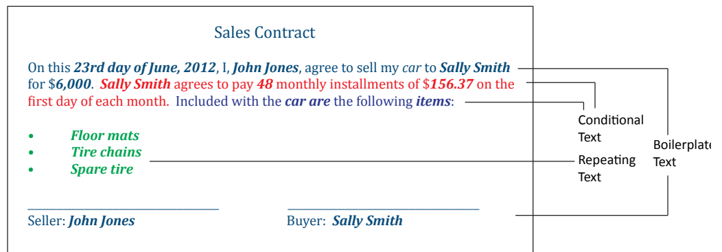
Figure 1. Simple sales contract with color-coding to demonstrate document structure.

Most types of legal documents have an inherent structure: a combination of boilerplate text, conditional text, repeating text, and simple/computed variables. Take, for example, the sales contract represented in Figure 1.